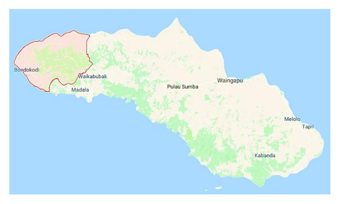
FIGURE 2. MAP OF SUMBA. SOUTHWEST SUMBA REGENCY MARKED IN RED.

To be able to adopt a more in-depth focus of the area under study, the choice was made to focus on the regency of Southwest Sumba as a geographical area (see figure 2). This area is of interest since the newly opened airport is located here, allowing an increasing number of tourists to enter the island. Tourism is still in its infancy, yet there is a Sumba Sustainable Tourism Coalition, trying to guide tourism into a desired direction. This coalition unites local and foreign stakeholders to support the local government by providing a sustainable tourism development plan for the whole of Sumba (UNWTO, n.d.).